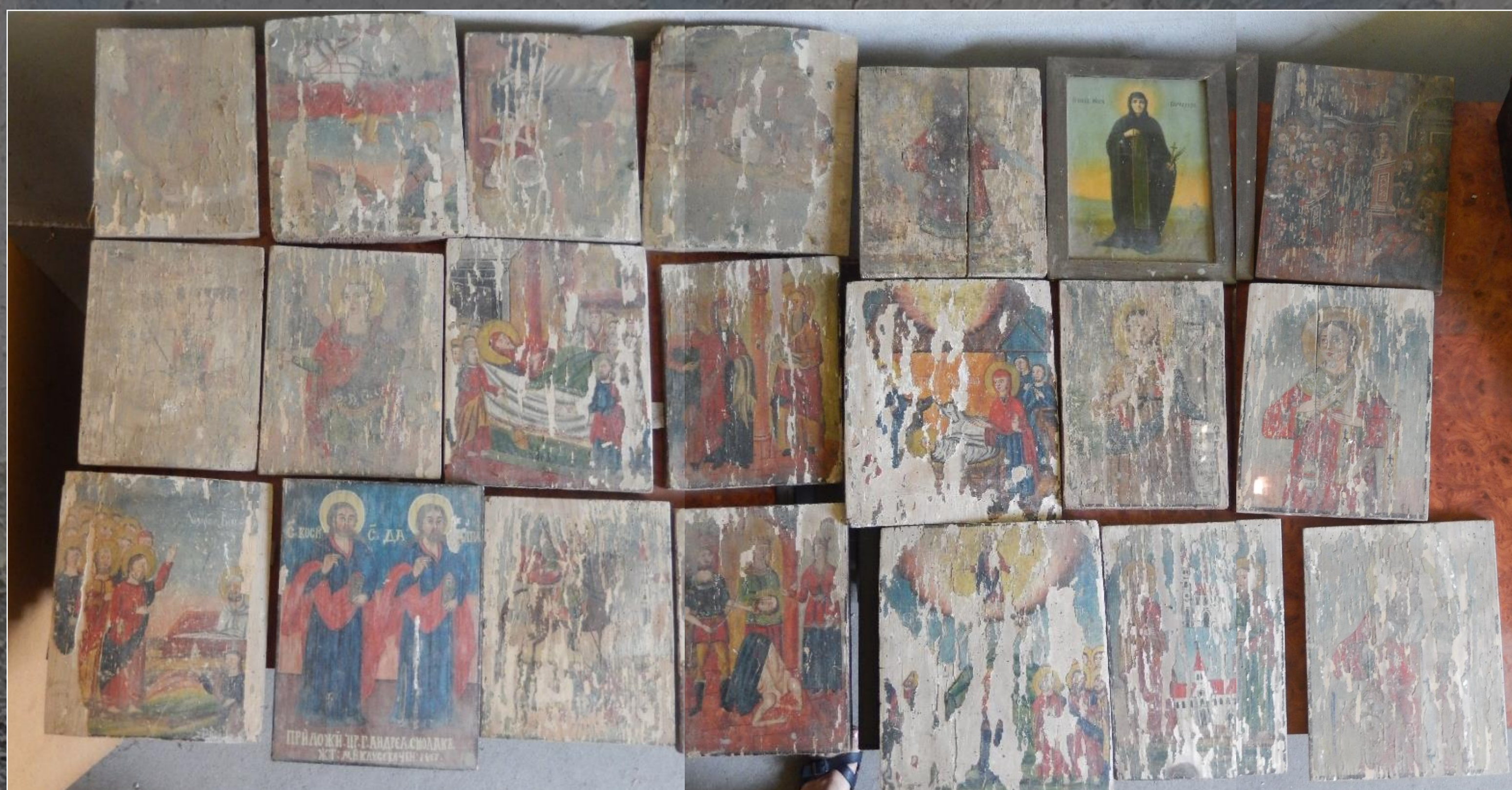
Picture 1 The Venerating icons of the church of St. Nicholas of Myra in Mikluševci, held in the parochial house