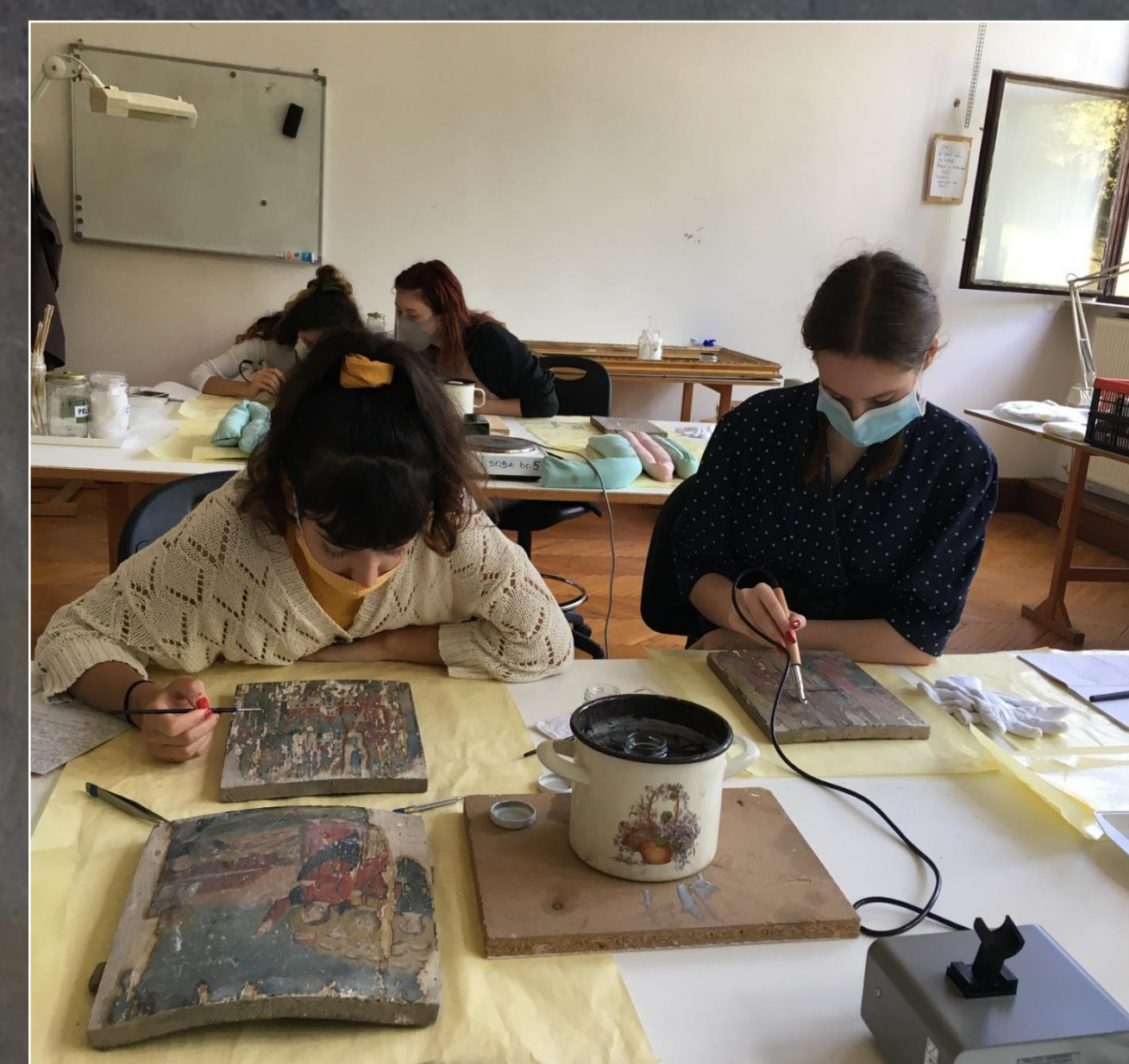
Picture 7 2 nd year students during consolidation treatments on icons