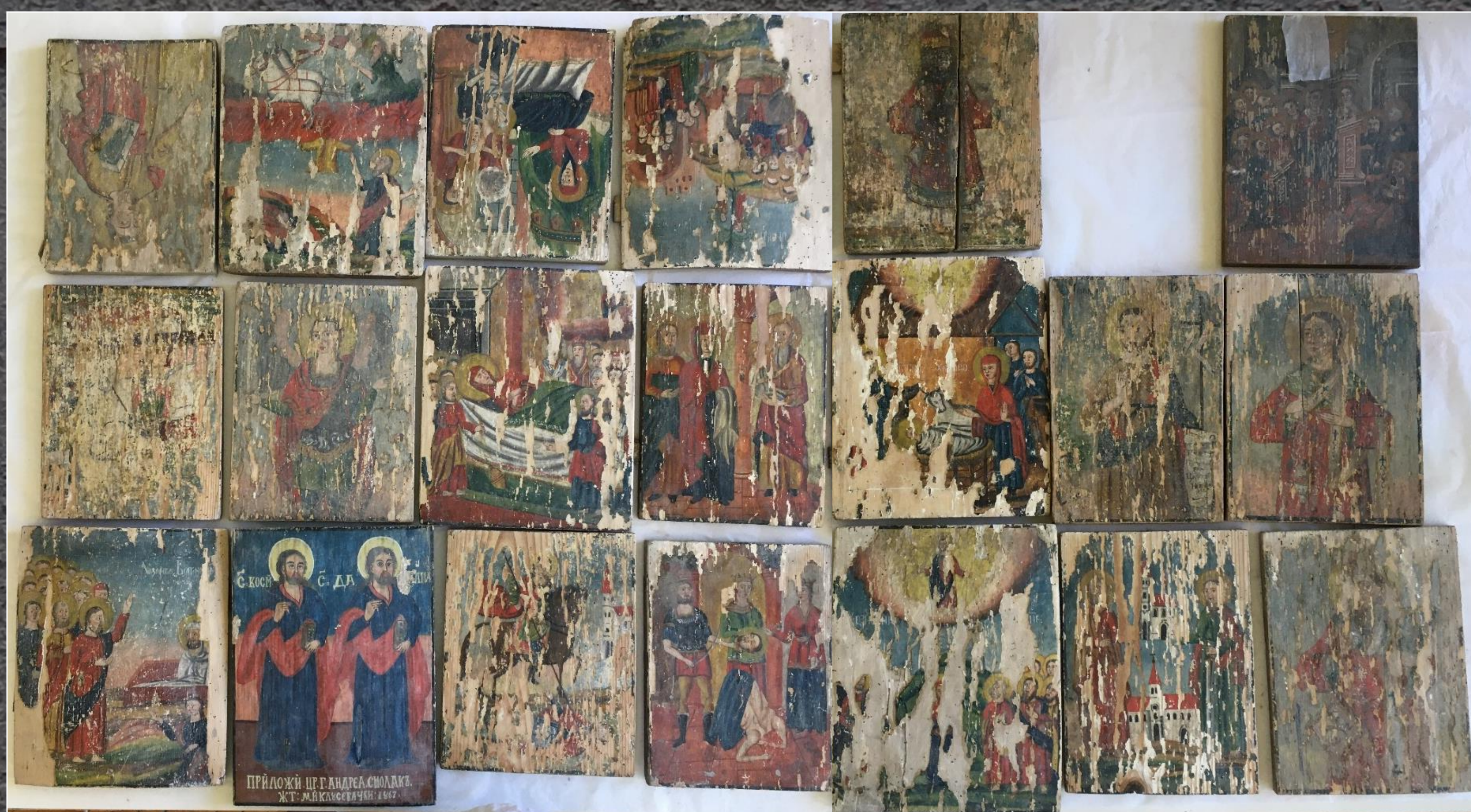
Picture 6 Venerating icons, during different stages of conservation treatments