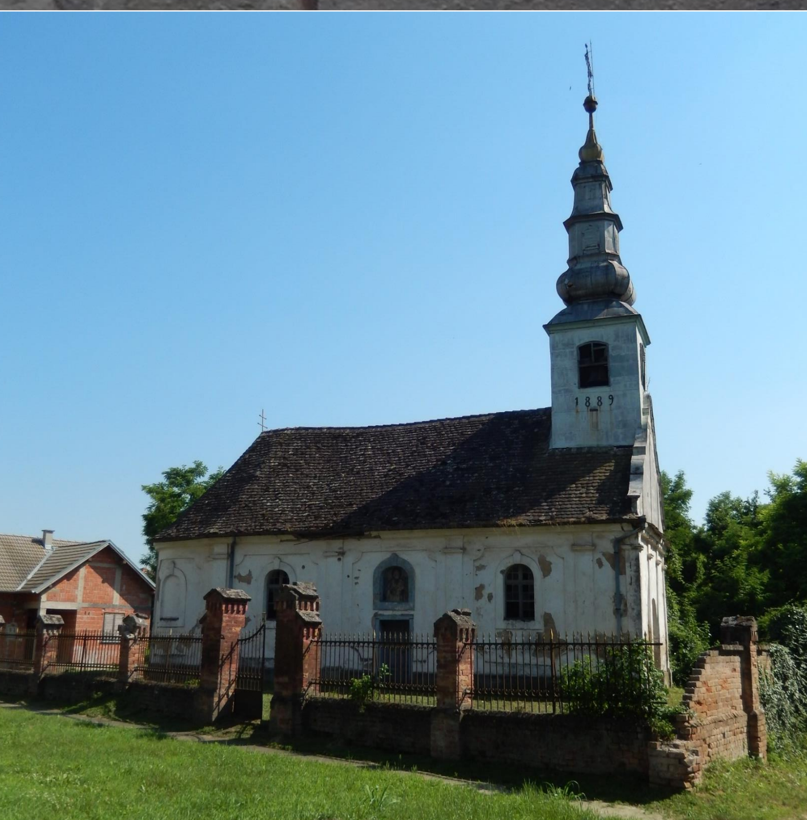
Picture 2 Church of Saint Nicholas of Myra in Mikluševci, near Vukovar, Croatia; the parochial house is visible on the left

This project was devised to give 2 nd year students a unique chance of in situ conservation practice, which is a rare occurrence in courses concerning easel paintings. The aim was to document and perform preventive treatments in order to transport the inventory to Zagreb for ionizing radiation at the Ruder Bošković Institute and subsequent treatments. Sadly, the worsening situation with COVID-19 lead to these plans being cancelled. The necessary treatments were performed only by T. Ukrainčik ( Picture 3 ) and B. Horvat Kavazović. After transport and radiation, the objects were brought to the Department and introduced to students as part of the curriculum.