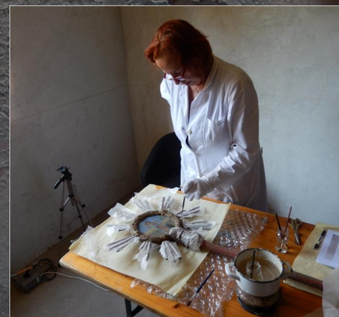
Picture 3 Consolidation treatment on one of four ripidas