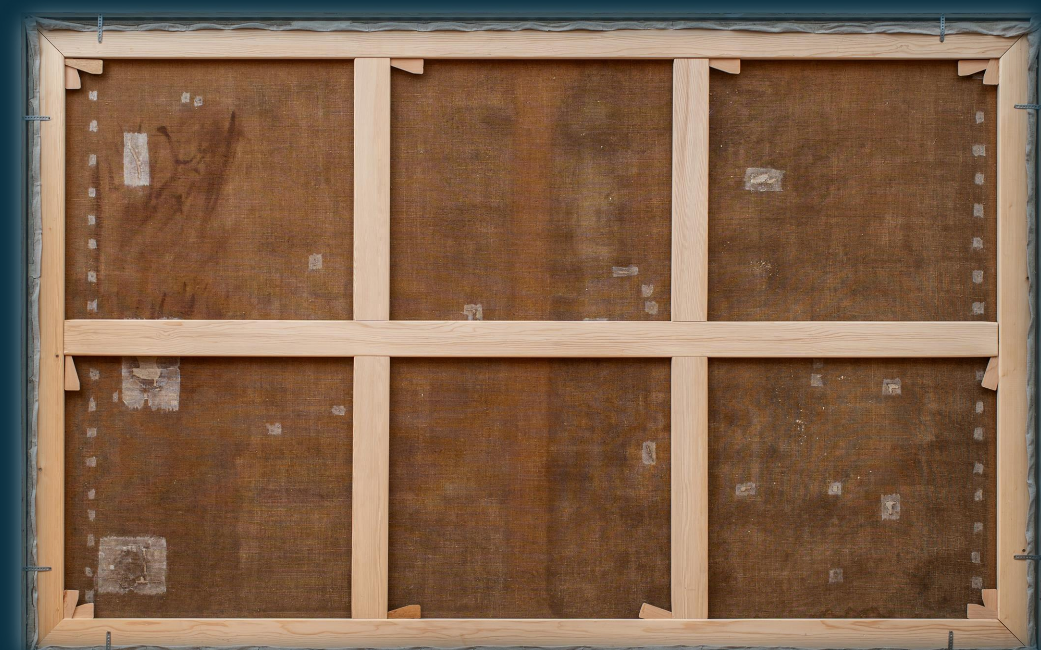
„Allegory of the Victory over the League of Cambrai”, front and back after conservation-restoration