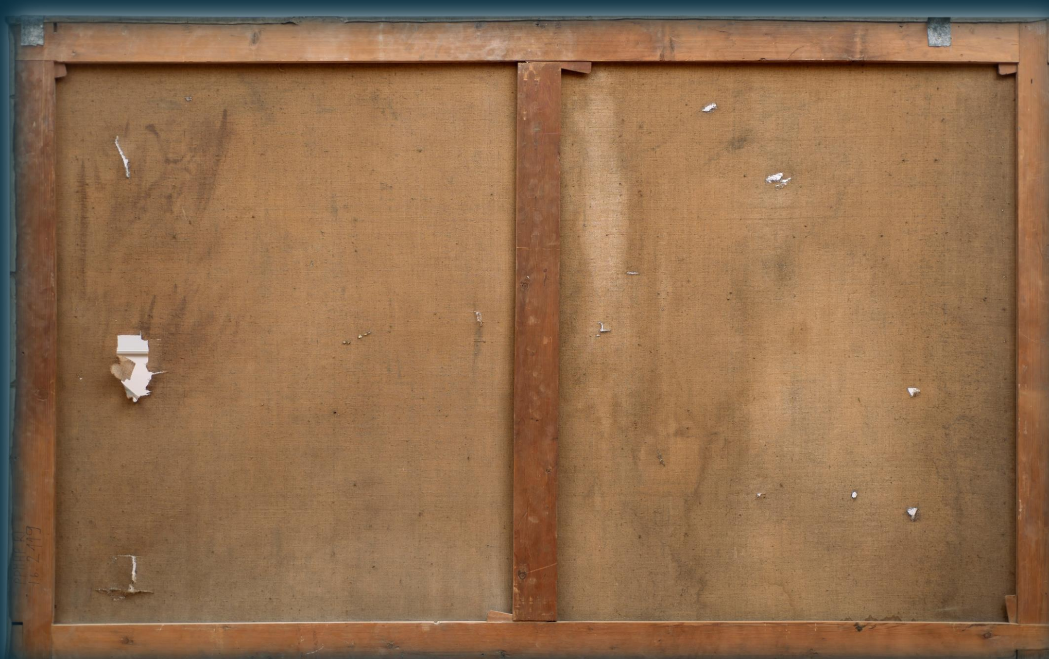
„Allegory of the Victory over the League of Cambrai”, front and back before conservation-restoration