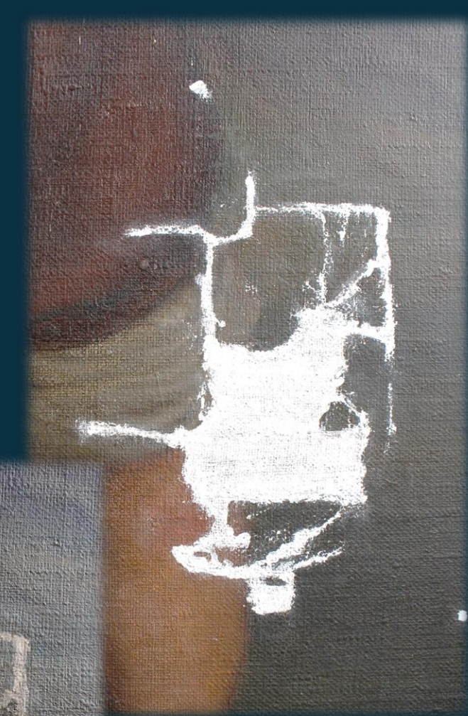
Surface texturing of the new filling and reconstruction of the paint layer