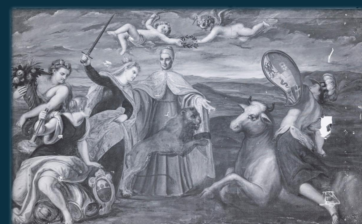
UV and IR photo, total