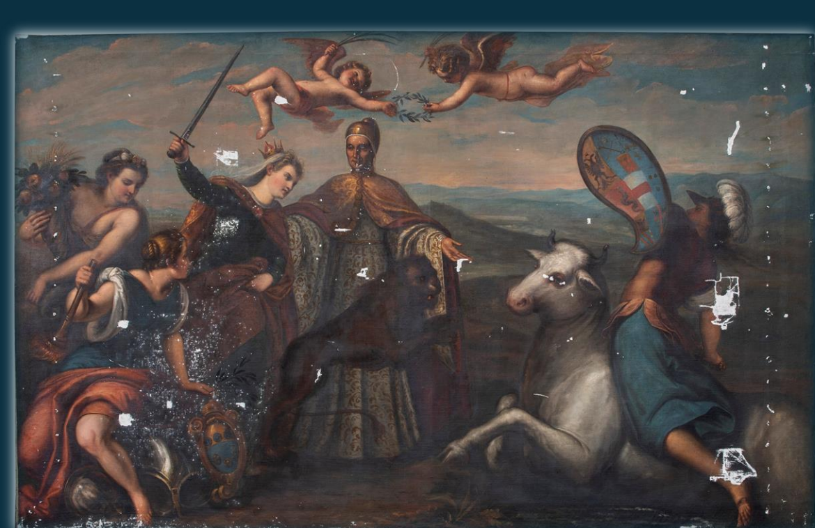
Reconstruction of the preparatory layer

The work included daylight, UV and IC photography, laboratory analysis and cleaning tests of the front and the back of the painting using solvents and dry-cleaning methods.